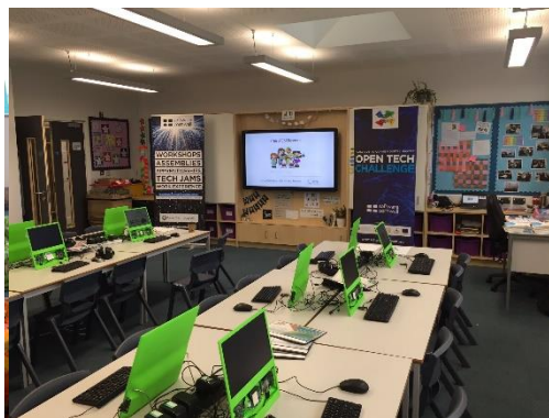
Hosting the Cornwall STEAM INSET