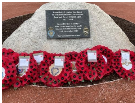
PHOTO: The opening of the Royal British Legion Woodland and the service of remembrance on 11 th November 2021.