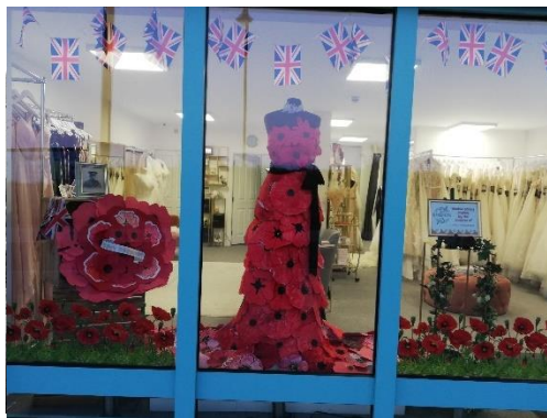
poppies making a beautiful window display at Bliss Bridal Gowns.