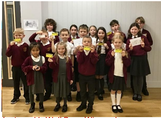
Last week's Well Done Winners!