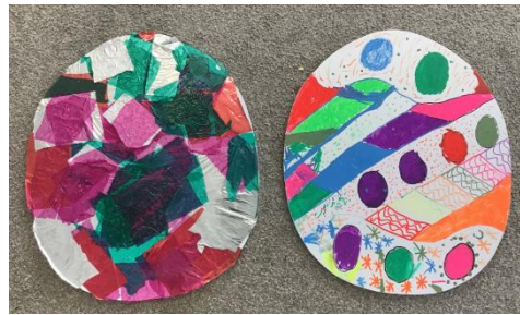
Photo: EYFS Giant Eggs for the Newquay Lions Easter Egg Hunt