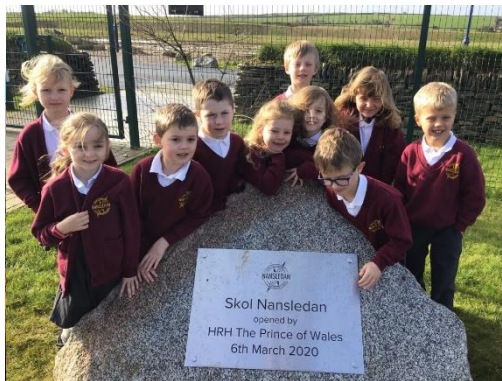
KS1 pupils gather around our commemorative plaque