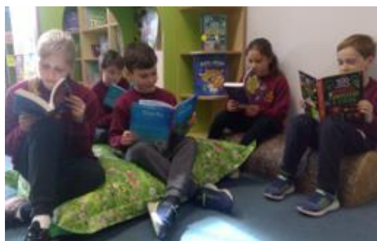
PHOTO: Pupils are delighted and grateful to receive an amazing donation of Usborne books.