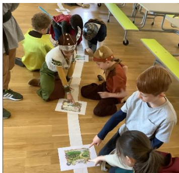
PHOTO: Y3 Vikings and Anglo Saxons mapping out a giant time-line.