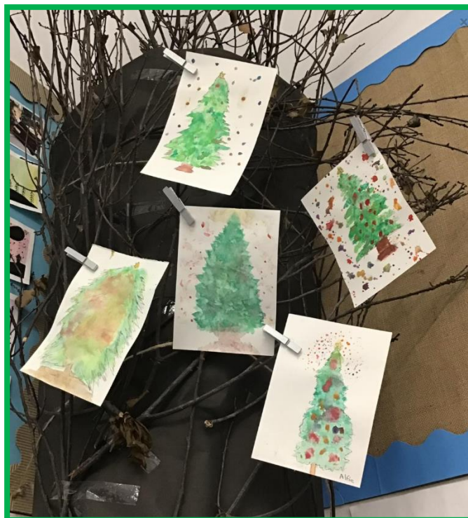
Beautiful watercolour paintings by Johnson Class

From all the staff at Nansledan, we would like to wish you all a very Happy Christmas and also good health, happiness and positive times to come in the New Year.