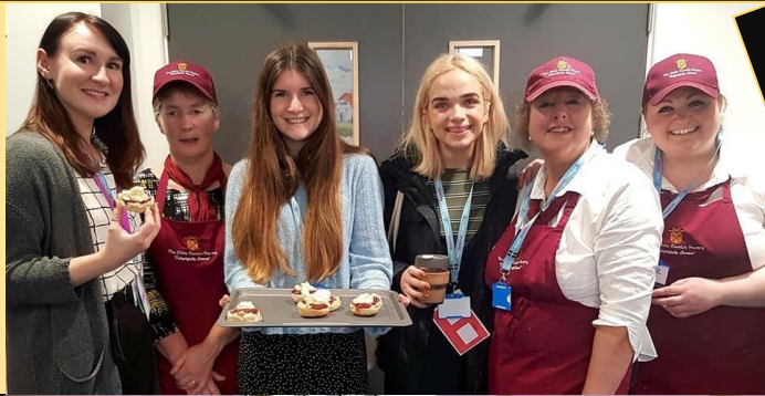
The Little Cornish Pantry Baking Session