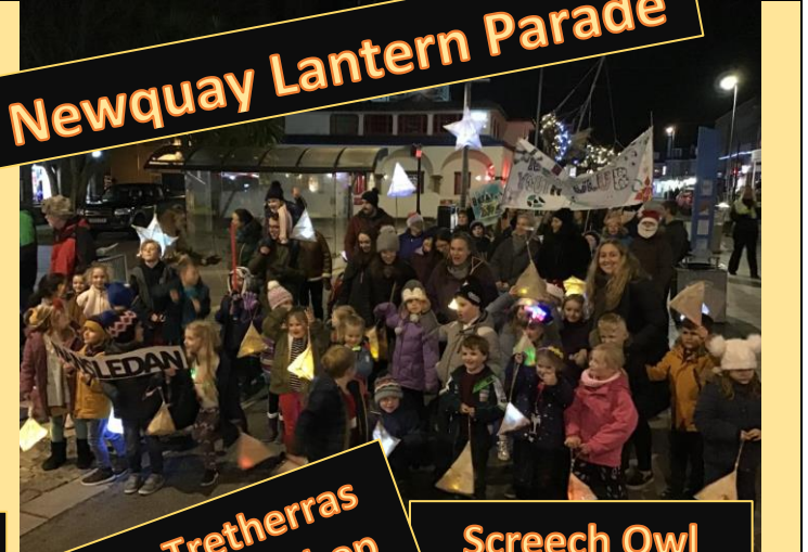
Newquay Lantern Parade