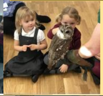
Screech Owl Sanctuary Visit