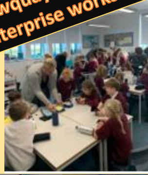
Newquay Tretherras Enterprise workshop