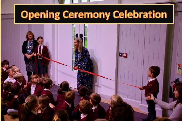
Opening Ceremony Celebration