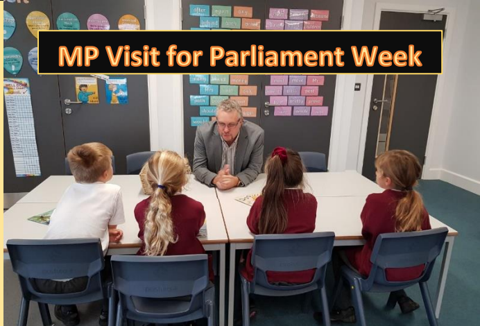
MP Visit for Parliament Week