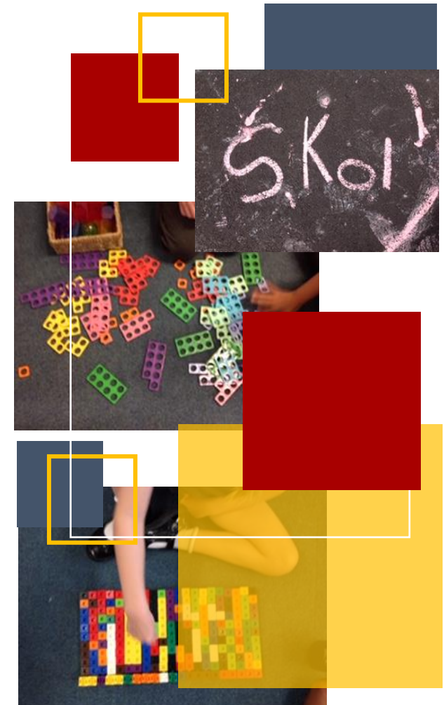
Exploring Learning Resources

Coming up: Please be aware that we are closed for an INSET day on Monday 30<sup>th</sup> September. All of our term dates & INSET dates are available on the school website.